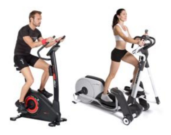
Figure 3: Machines that generate energy.

A direct benefit to users is the economic benefit. The more exercise they do, the more energy they will generate and the more discount they will have to use the facilities. The most loyal users will have a better quality of life by carrying out more sport and the satisfaction of contributing to a healthier and more sustainable environment.