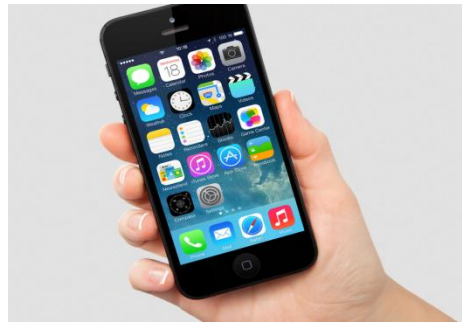
Figure 2: Mobile App.

Users with a smartphone can install an application with which they will have a follow-up of their exercise sessions, calories consumed, energy generated, contribution to the environment.